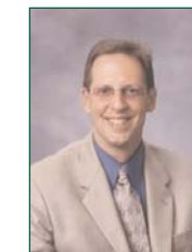
Joe Paprocki Loyola Press